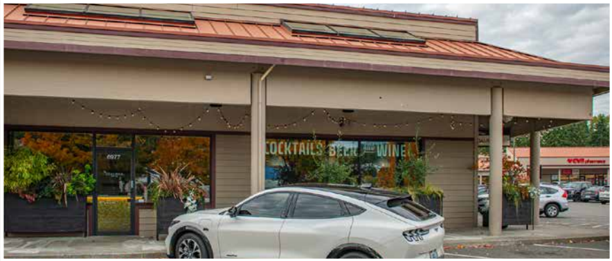
North Corner View on Coal Creek Parkway