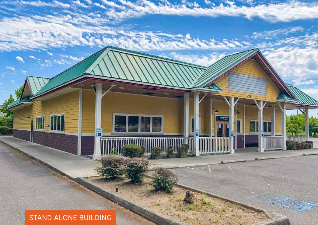
STAND ALONE BUILDING