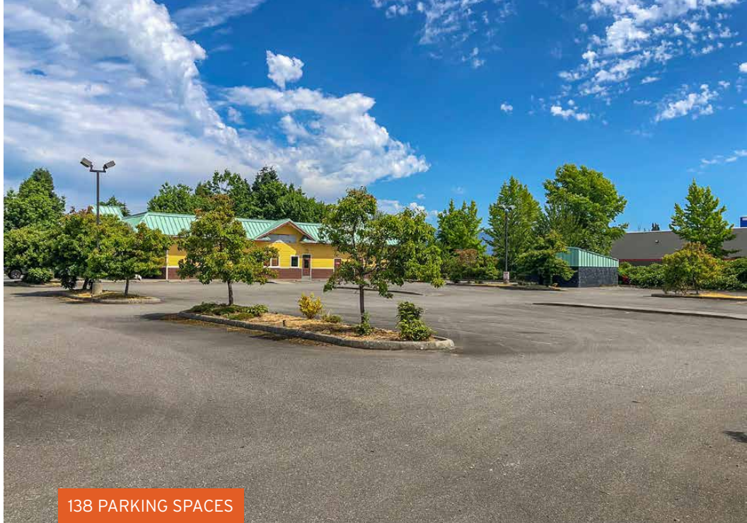
138 PARKING SPACES