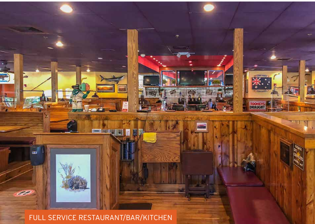
FULL SERVICE RESTAURANT/BAR/KITCHEN