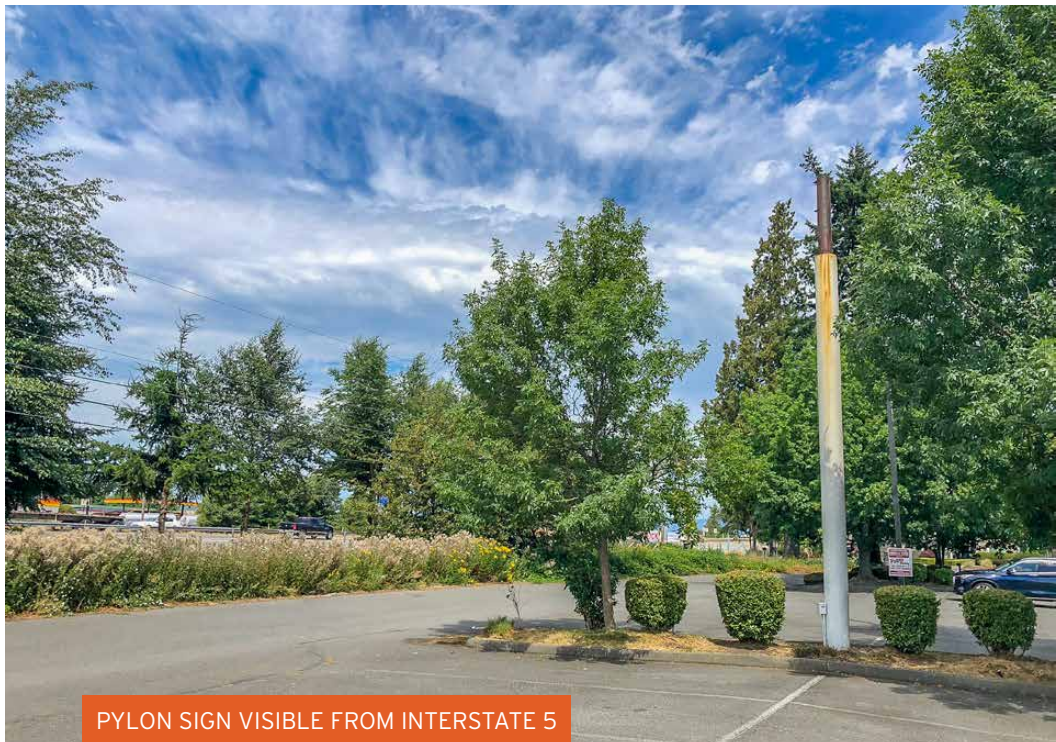
PYLON SIGN VISIBLE FROM INTERSTATE 5