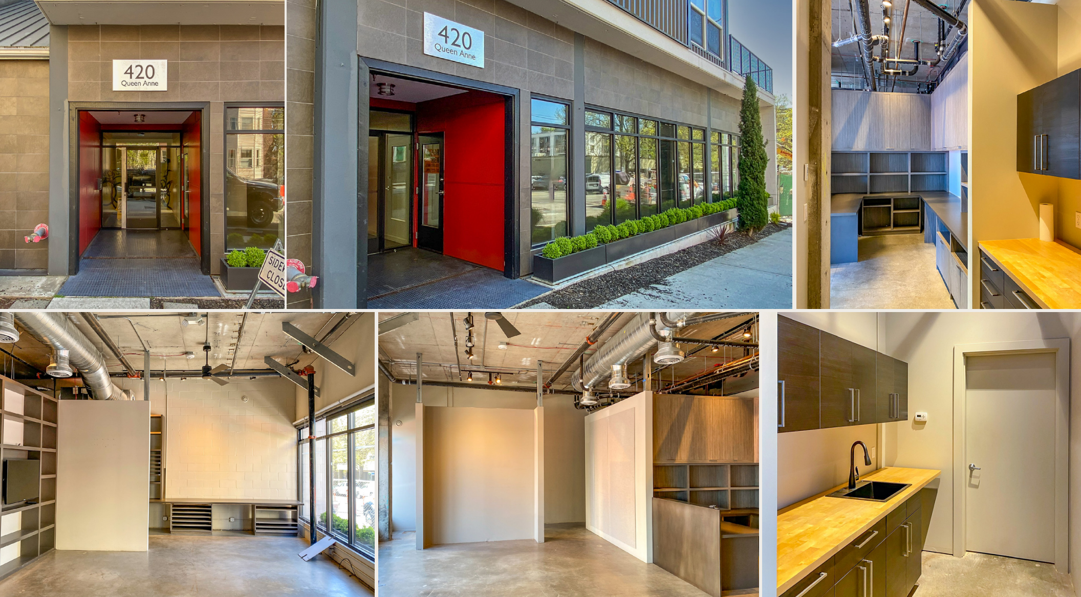
Space features a beautiful interior buildout with kitchen.