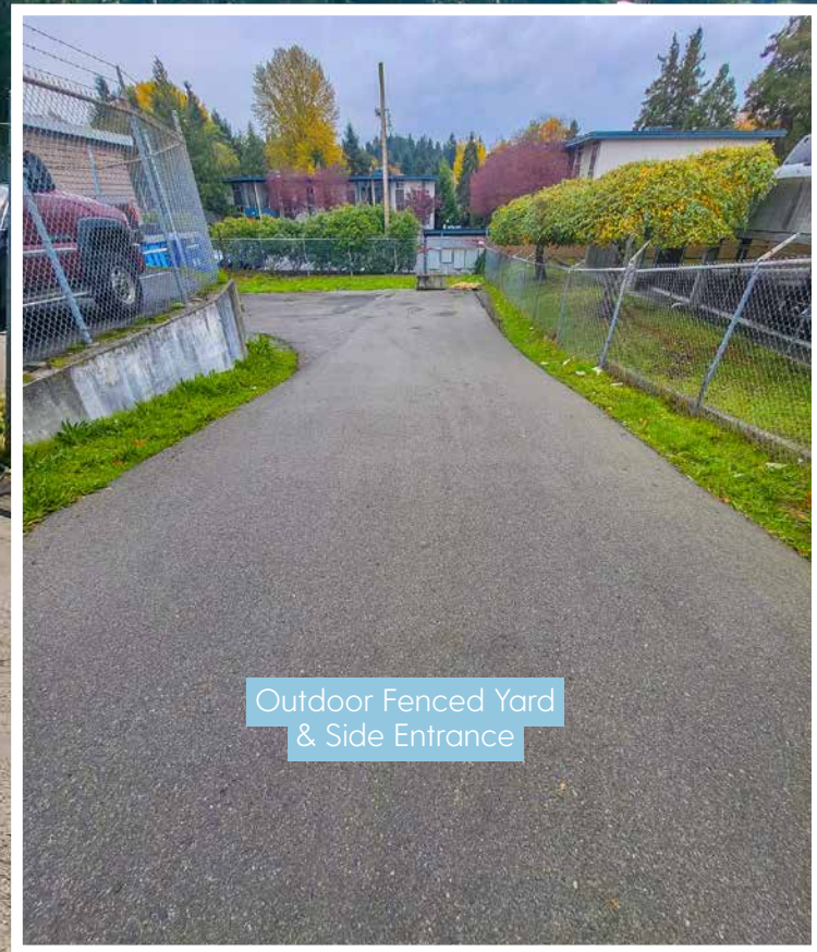
Outdoor Fenced Yard & Side Entrance